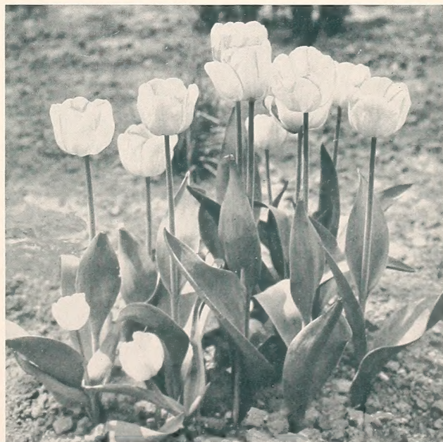
A Cluster of Beautiful Darwin Tulips